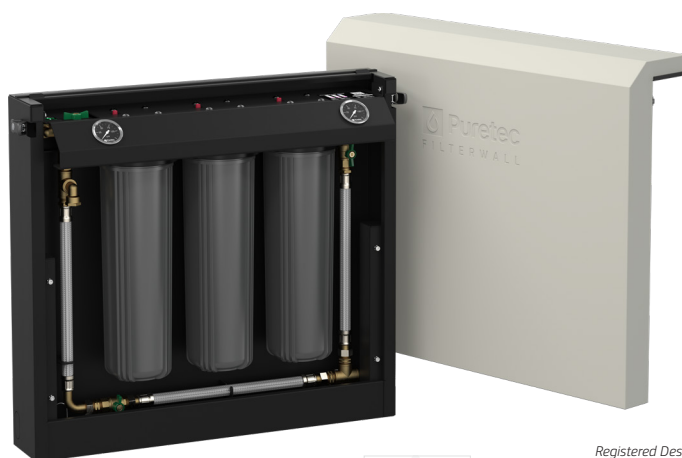
3-Stage Filtration System with Bypass