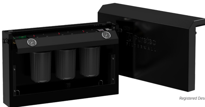
3-Stage Filtration System - No bypass