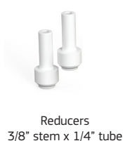
Reducers 3/8" stem x 1/4" tube