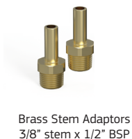
Brass Stem Adaptors 3/8" stem x 1/2" BSP