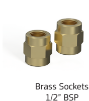
Brass Sockets 1/2" BSP